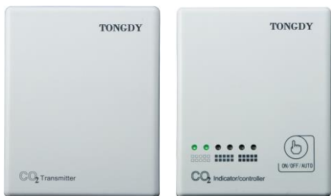
TSM-CO2-S series TSM-CO2-L series